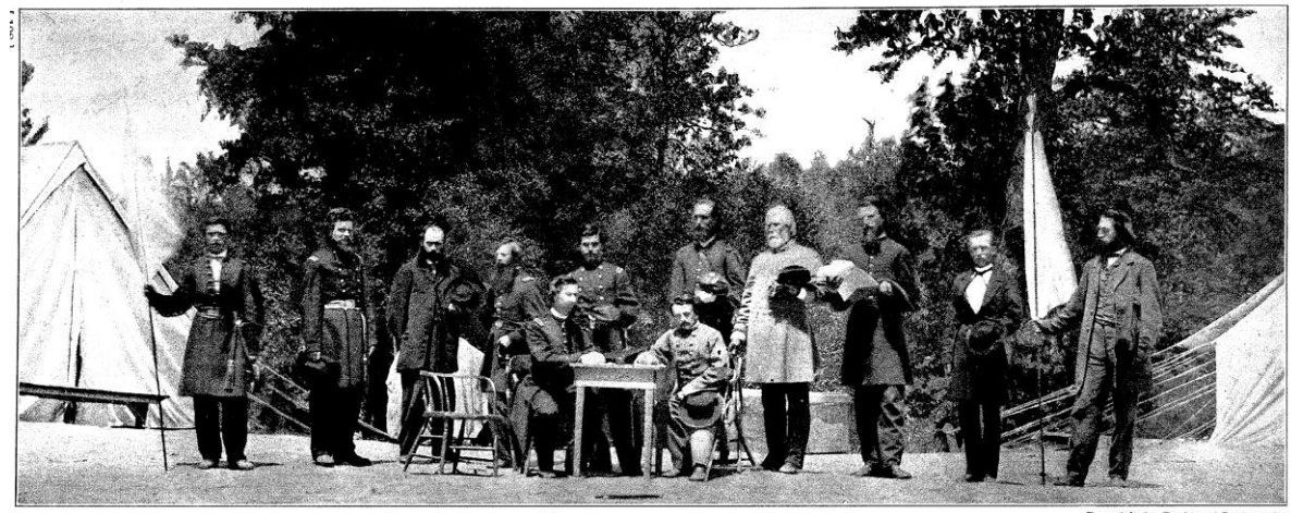
THE LAST EXCHANGE. CAMP FISK, FOUR MILE BRIDGE (VICKSBURG), APRIL. 1865

Camp Fisk was located at Four Mile Bridge. Officers from both sides met daily to negotiate the exchange of prisoners.