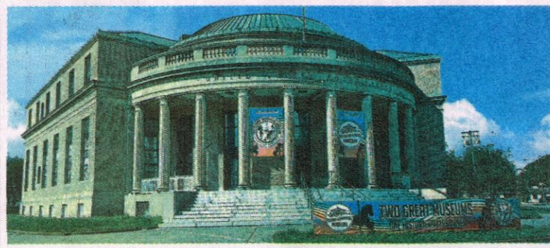
Visitors can explore both the Downtown Sandusky Cedar Point Historical Museum and the Merry-Go-Round Museum—located in the historic 1927 Sandusky Post Office—with just one admission ticket.

There's classic ride signage, and even a car from the now-retired Snake River Falls ride. And with your admission ticket, you can take a spin on the fully restored Allan Herschell carousel with its beautiful hand-carved horses. A continuous video with rare film footage of the park helps you relive your fun days at The Amusement Park™ as well.